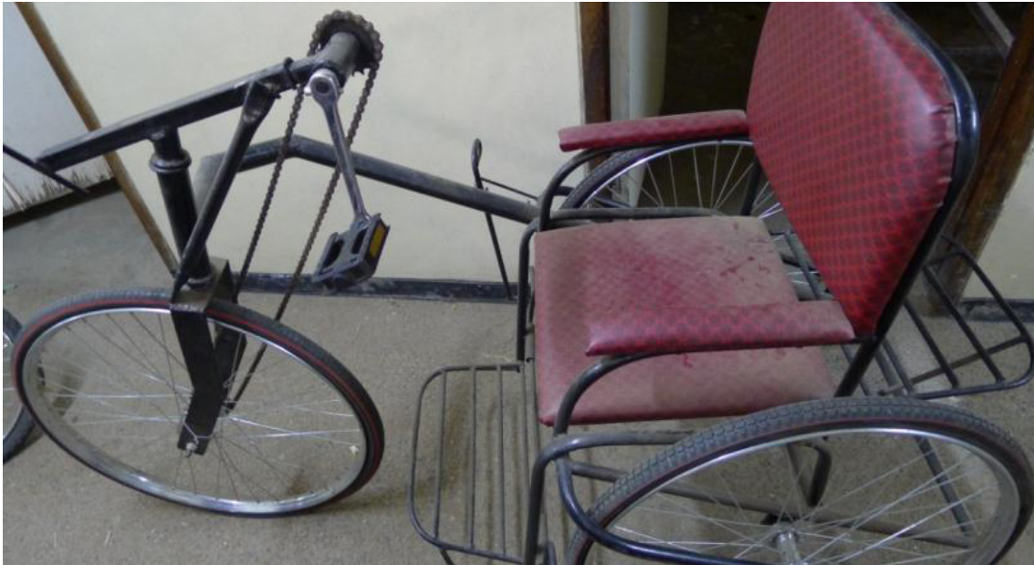
Picture from a workshop in Malawi where they make tricycles, artificial limbs and other things that help persons with difficulties in walking (Malawi Council of the Handicapped, MACOHA).

The consultants found that most of the disability projects focussed on persons with physical impairments. Persons with developmental disabilities and those with hearing impairments were the last to be reached.