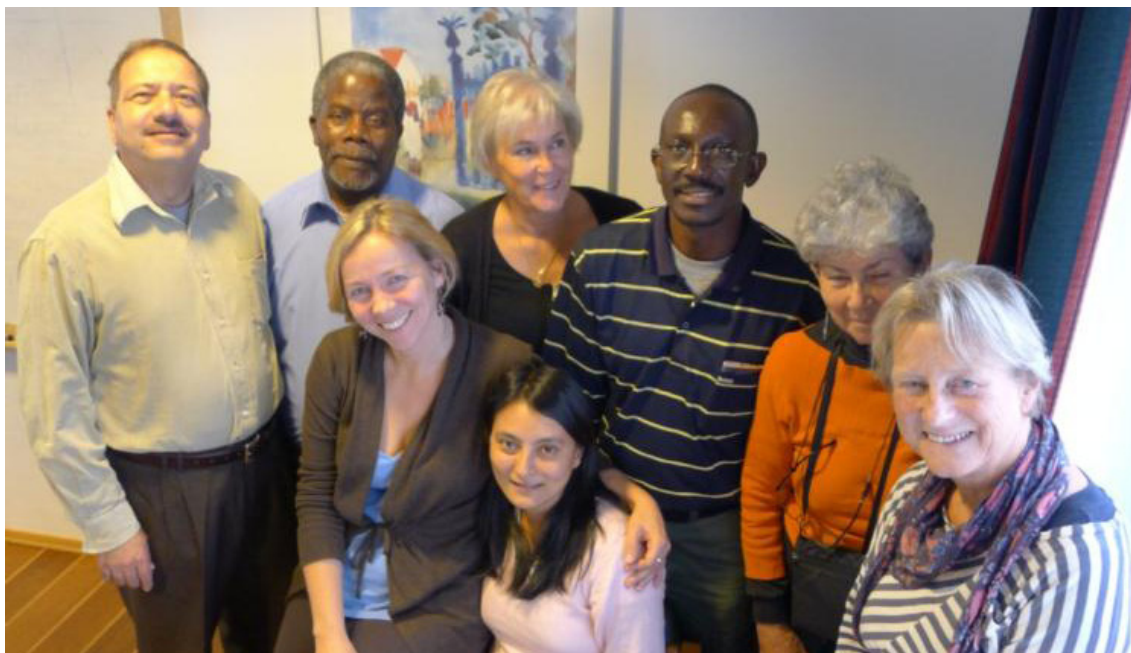
All the consultants met in Oslo to write the reports

In 2010, Norad wanted to find out if the Norwegian development aid had made life better for persons with disabilities. Norad asked consultants to help. The consultants came from Norway, Uganda, Palestine, Malawi and Nepal. The consultants read documents and statistics. They talked to people in these five countries. Totally they asked more than 350 persons about their opinion. They talked especially to persons with disabilities to find out if their lives had been better.