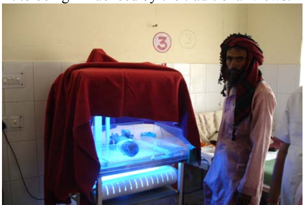
The husband decides on institutional delivery

An in-depth study on "impurity-related" behaviour inside hospitals would provide a useful key to explain the quality of care and the distribution of tasks among various categories of workers in the health services. It would be valuable to know more about how middle-class and urban staff in health facilities relate to rural SC and ST women. Even if staff are educated and socialized to some extent into western ideas of care, they would not easily admit to being influenced by the traditional views.