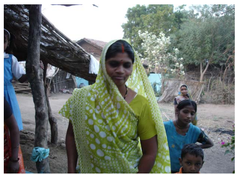
The ASHA is not a paid employee. However, she will be eligible to compensation for services provided under various ongoing schemes and programmes run by GoI and state-governments, for example institutional delivery under Janani Suraksha Yojana; completion treatment under the TB control programme, promotion of household toilets under the Total Sanitation Campaign, all under the overall guidance of the District Health Mission.

Another important role of ASHA is counselling women on birth preparedness, immunization, contraception, RTI and STI. The ASHA guidelines also underline that ASHAs should undergo induction training and in-service training supported by training material. There will be one ASHA for every 1000 population, but in hilly terrain and deserts, the norm of 1000 may be relaxed.