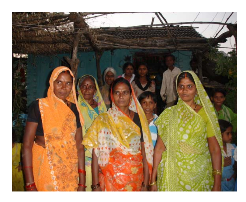
Panchavat leader from SC (left)