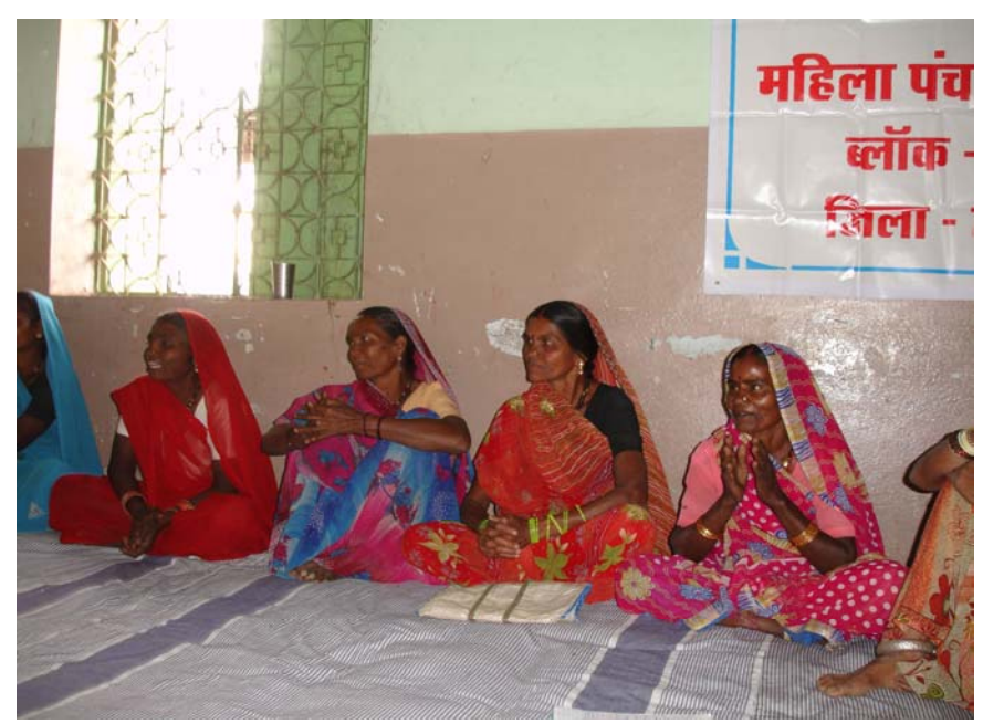
Elected women from SC and ST